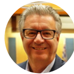
Mayor Lyn Hall (City of Prince George)