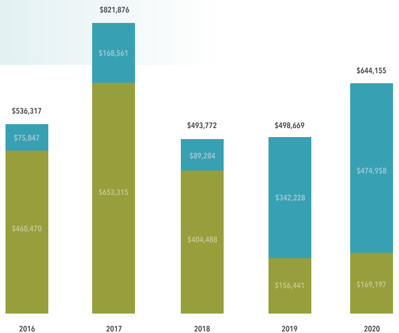
Philanthropic Development - Donations & Contributions Year over Year Fiscal Year as of August 31

Note: 2017 was a particularly strong year due to several regional partners pooling funds.